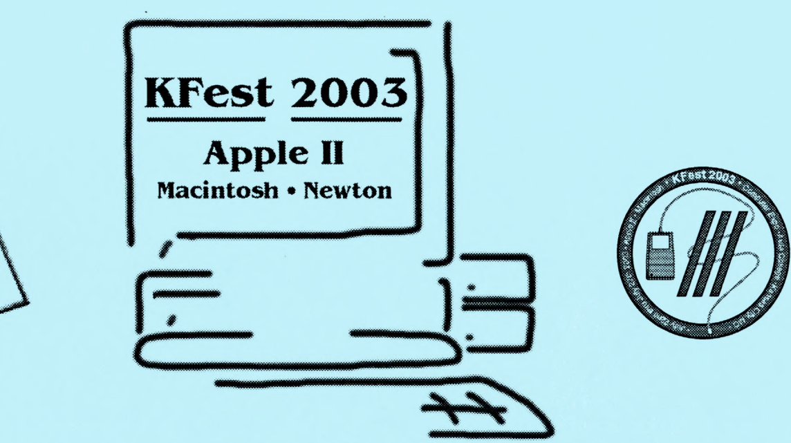
July 22nd - 27th 2003 Avila University - Kansas City, Missouri