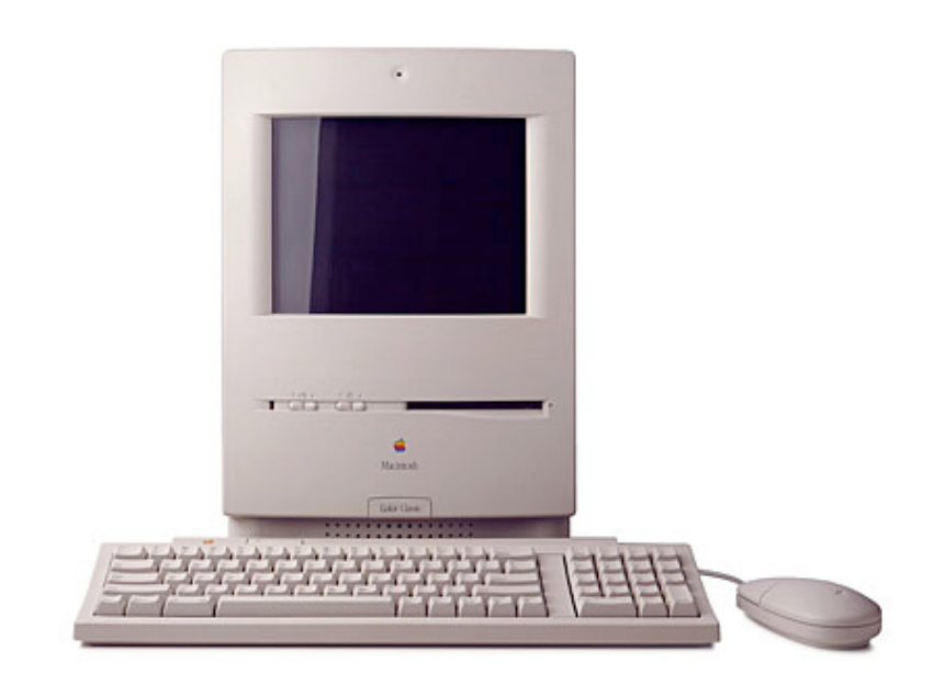
Color Classic Color Classic II Performa 250, 275