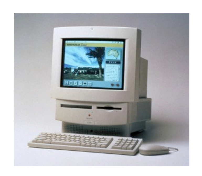
LC/Performa 520, 550, 560, 57x