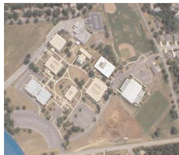
Avila From 3,000 ft.