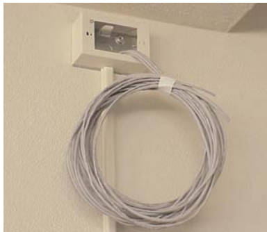
"Thank goodness we went wireless"